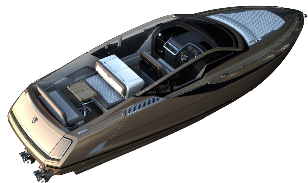
ASHEN METALLIC GLOSS