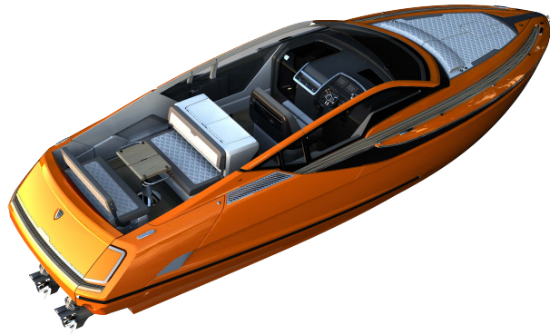
SUN BURNT ORANGE

Choose the colour you desire, whether it's one shown here or your own choice, and your F//LINE 33 will become wholly yours.