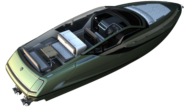
MATTE PINE GREEN METALLIC